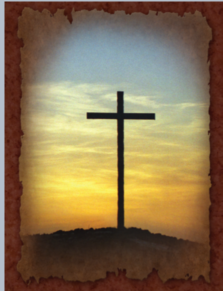
For millions around the world, the cross of Christ has led to eternal life.

Hebrews 1:1-3 says: “God, who at various times and in various ways spoke in time past to the fathers by the prophets, has in these last days spoken to us by His Son, whom He has appointed heir of all things, through whom also He made the worlds.”