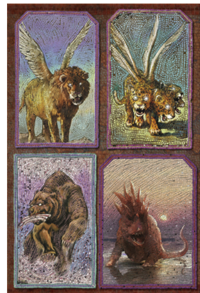
Daniel 7's beasts represent four kingdoms