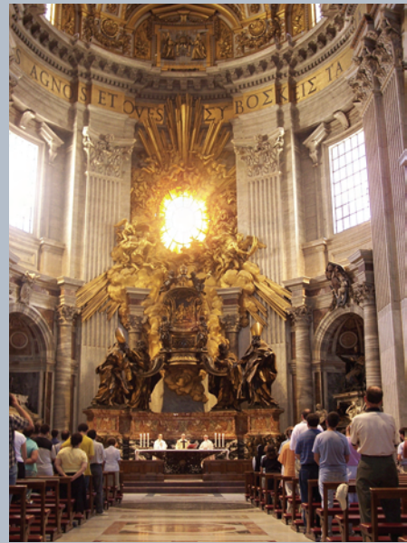
A false belief has been long entrenched in Christianity

Here is where the similarities stop. Daniel is given greater details of this final beast – the one that not only is terrible, but also has 10 horns (like the image of Dan. 2 had ten toes) and out of which grew a “little horn” that “spoke great things” against the Most High (Dan. 7:8). So, what is this little horn power? Here are nine characteristics from the Bible: