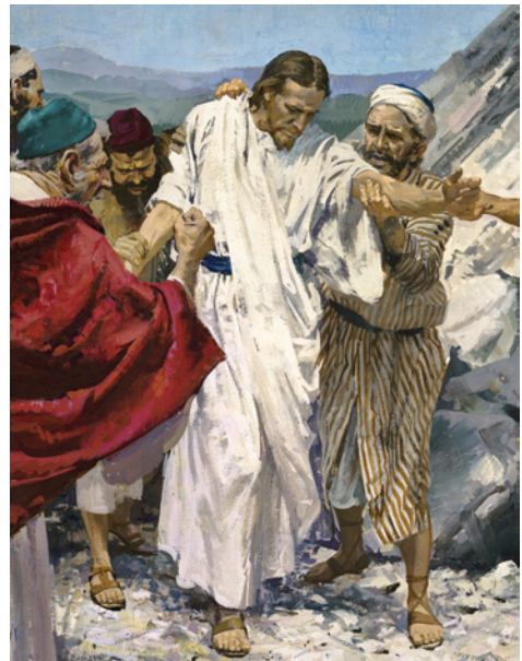
Jesus was despised and rejected by men.

(2 Corinthians 5:21) Would you like to have the righteousness of God? Place your life within the life of Jesus and God's Holy Spirit will make your decision a reality. Jesus is knocking at your hearts door. Won't you listen to His voice and open the door? (Rev. 3:20)